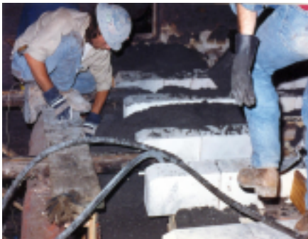
Hearth installation with skid block and castable